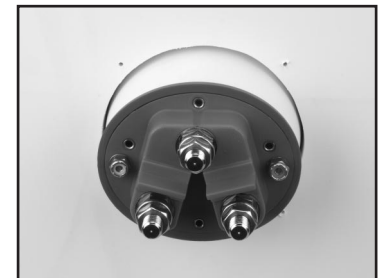
Back View Installed

Catalog Numbers: 8521C (Bulk with Cup) 8521DPC