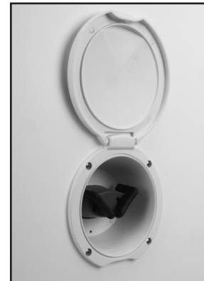
Front View Installed