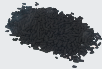
Activated Carbon Volume varies depending on application

The "floating bracket" also protects end caps from heat so that the factory installed heat shield is all that is needed to meet engine compartment requirements for fire protection. Builders simply install as usual with no additional effort or insulation requirements.