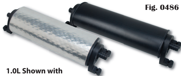
1.0L Shown with Optional Heat Shield

Delphi canisters are available in sizes ranging from 0.5L to 4.0L. Each size offers hose nipple connection options of 5/16" in and 5/8" out or 5/8" in and 5/8" out. The same configurations are also available with a heat shield if required.