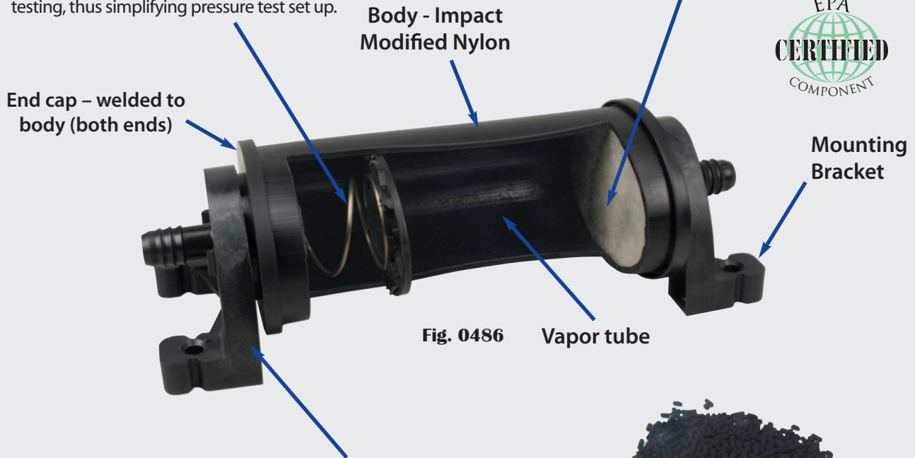
Fig. 0486 Vapor tube

Large surface area filters located at each end of the canister keep carbon in place and allow for the lowest airflow restrictions available.