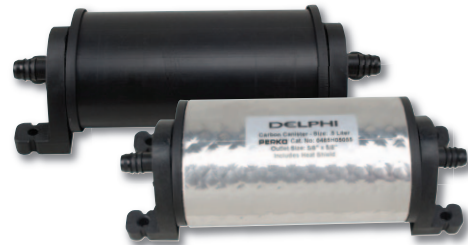
0.5L Shown with Optional Heat Shield